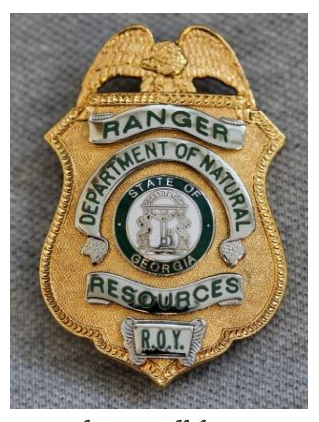
Law Enforcement Off the Pavement!

A one of a kind Ranger of the Year Badge was designed this past year to be presented to and worn by the current ROY. The badge will be passed from Ranger to Ranger each year as a way to highlight that officer's dedication, hard work, and commitment to the Division's mission.