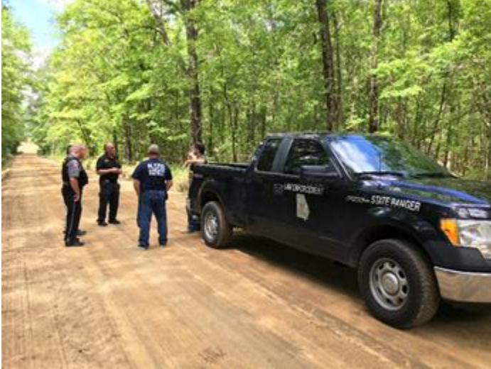
Officers preparing to search wooded area.

Later that day, Game Warden Mills was contacted to assist the Dodge County Sheriff's Office with searching for evidence in a double homicide case. Evidence pertaining to the case was located.