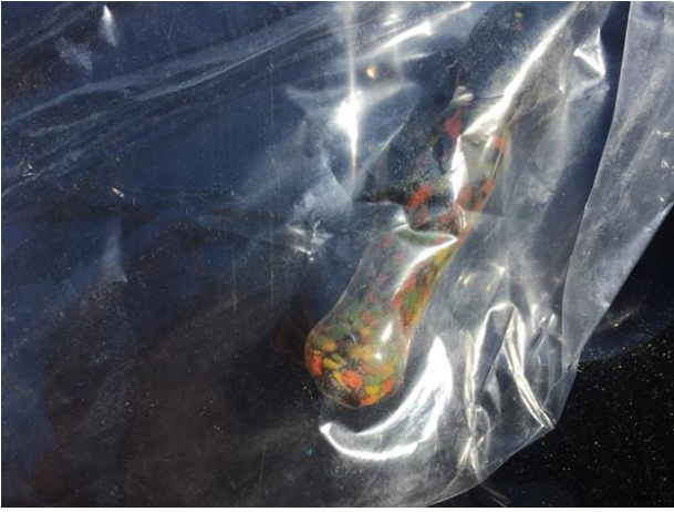
Marijuana pipe with residue of suspected marijuana found by game wardens.