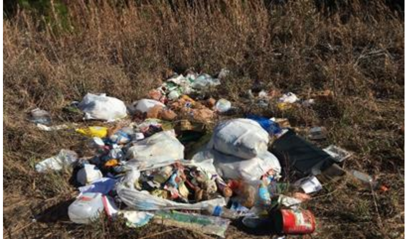
Household garbage dumped in Echols County.

On December 12 th , Game Warden Daniel North received information that there was a pile of trash that had been dumped on private property off of GA Hwy 94. Warden North travelled to the location and was able to determine who had placed the trash at that location. Warden North went to the suspect's residence where a violation of littering was documented.