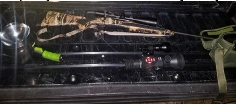
Weapon & equipment used by Bacon County deer poachers.

On December 16 th , game wardens conducted night deer hunting surveillance in multiple locations across Bacon County. During the detail, 18 violations related to hunting deer at night were documented on several individuals.