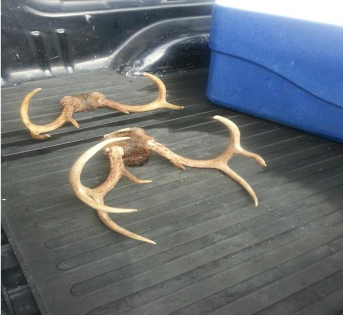
September 11 Atkinson County Buck on Top September 12 Coffee County Buck on Bottom

On September 12 th , Corporal Tim Hutto completed a complaint based investigation on a subject who killed an eight point buck at night on September 10 th . After interviewing witnesses and gathering evidence one subject was charged with hunting deer at night. One eight point buck and a cooler of deer meat was confiscated.