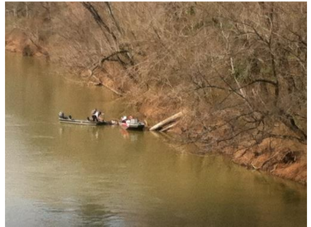
Searchers looking through a log jam on the side of the Etowah River.