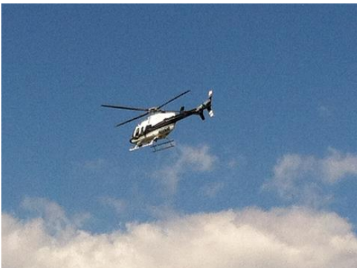
DNR Aviation does an aerial search of the Etowah River.