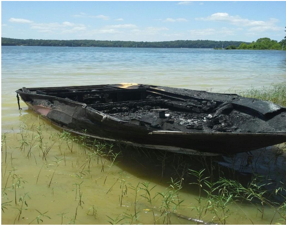
Burned Sylvan Ski boat on Allatoona Lake

On June 14 th , Sgt. Mike Barr, Cpl. Byron Young and RFC Zack Hardy responded to a call of a boat fire at Sweetwater Campground on Allatoona Lake. The officers found a 19 foot Sylvan Ski boat completely burned. The operator was alone when a fire started in the engine compartment. The operator jump in the water and swam to shore uninjured. The vessel was a total loss.