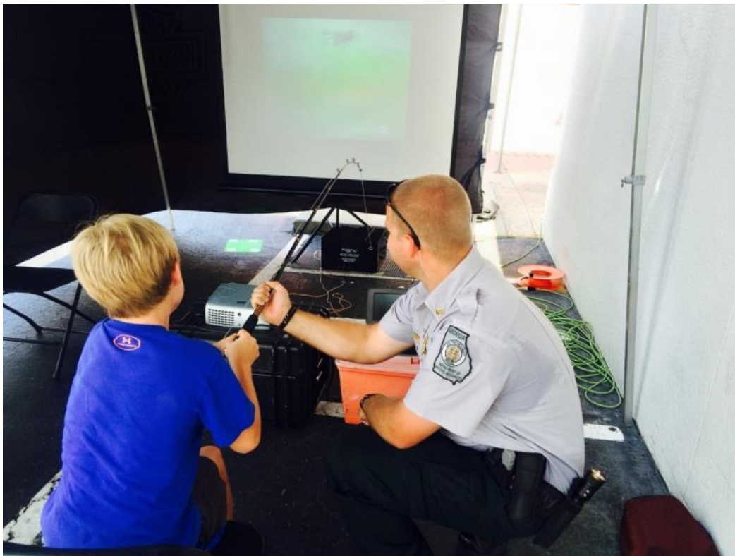
Helping a young man on the fishing simulator at Harley Davidson of Savannah