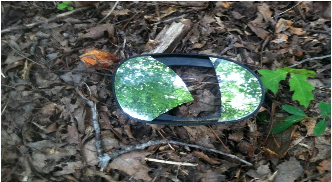
A part of the side view mirror that struck a female pedestrian at Cloudland Canyon State Park. DNR LED is investigating the incident in cooperation with the Dade County Sheriff's Office