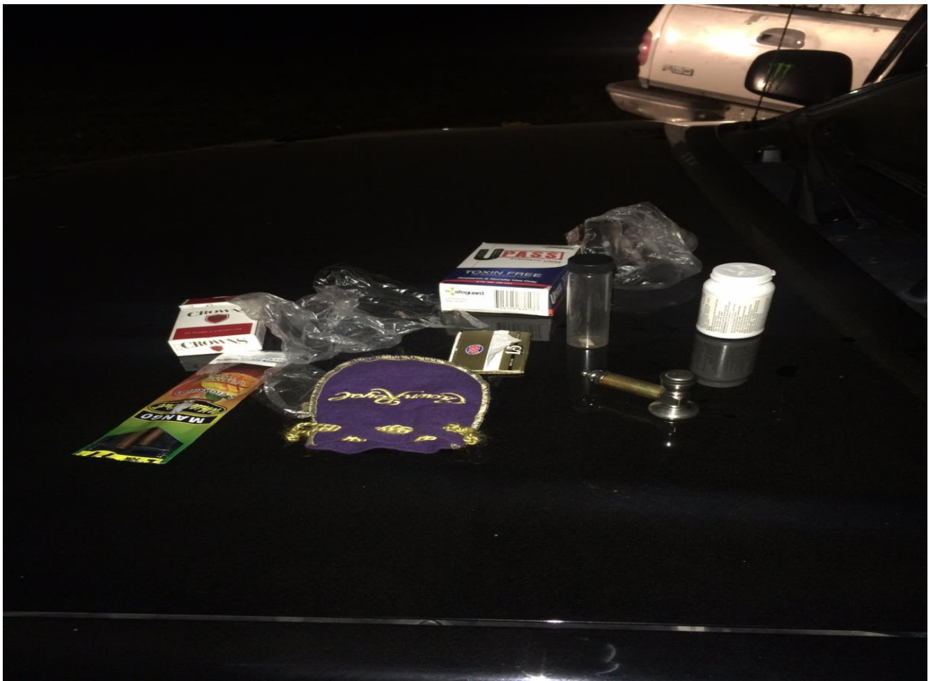
Drug paraphernalia found on subjects at the Johns Mountain WMA shooting range