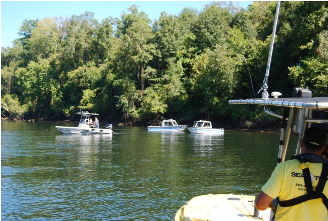
DNR Rangers pull a side scan sonar unit during a search for the missing plane.

On September 24 th , Rangers assisted the Clay County Sheriff's Department in recovering a light plane and its two occupants from the Chattahoochee River. The plane had been missing for seven days and was the focus of an intense search by agencies from Alabama and Georgia.