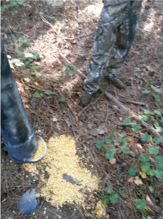
Whole corn and feeder

On September 21 st , Cpl. Lee Burns was re-checking an area known to have baited deer in the past and happened up on a hunter that was hunting over a freshly baited stand. The hunter was charged with hunting big game over bait.