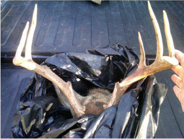
Illegally Harvested WT Deer