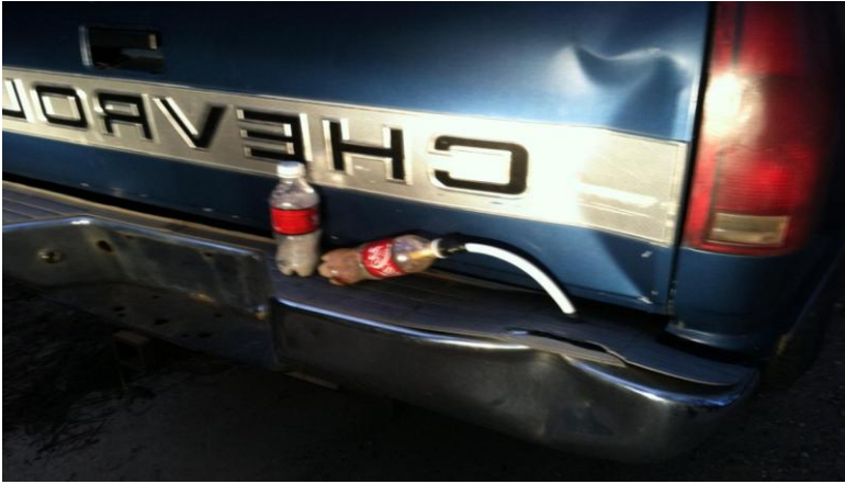
(Mobile “meth lab” seized from vehicle in Thomas County)