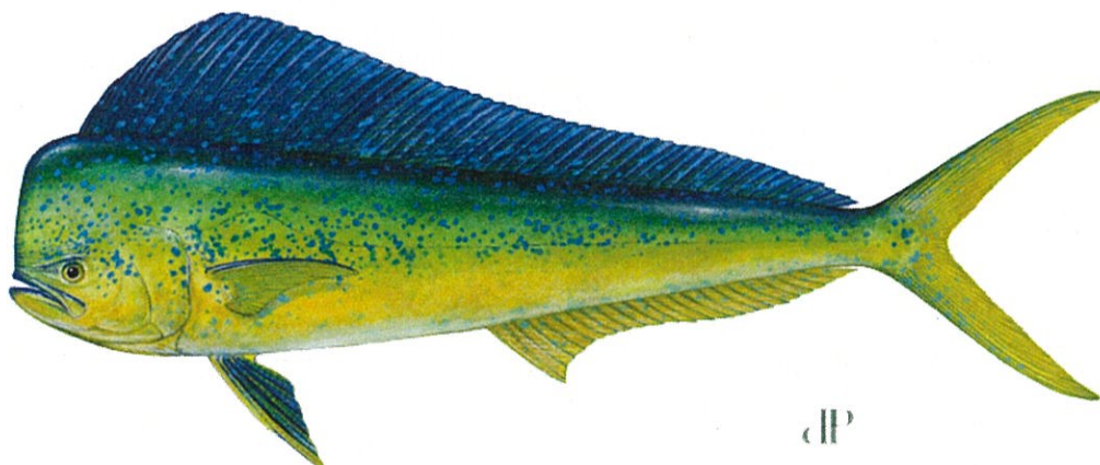
Illustration by Dianne Rome Peebles