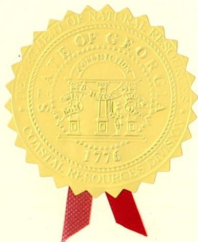
GOVERNOR State of Georgia