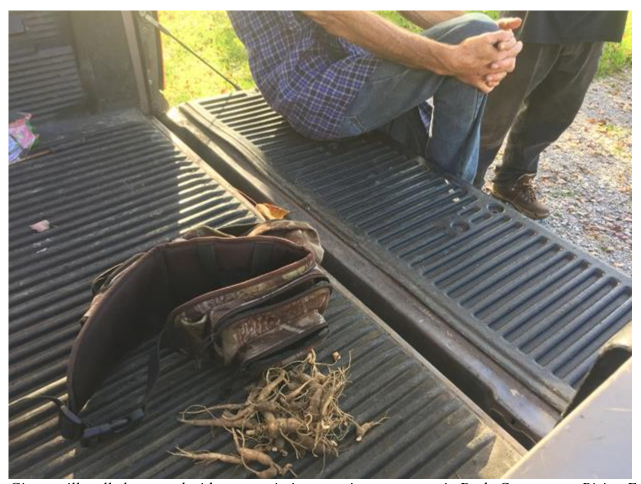
Ginseng illegally harvested without permission on private property in Dade County near Rising Fawn.