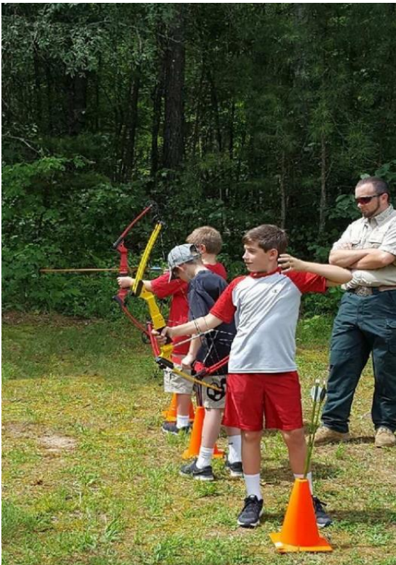
Campers learned to shoot bows at Kids VS. Wild Summer Camp in Floyd Co.