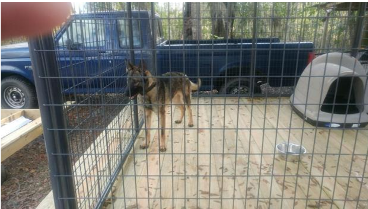
K-9 Case is newest officer in Region 7. Case's handler is Game Warden Jack Thain.

02/25/17- Game Wardens Bill Bryson and Tim Morris patrolled the Ogeechee River for boating and striped bass fishing activity. While on vessel patrol the Game Wardens checked numerous boaters and anglers. The following violations were documented: operating vessel within 100' of object/shore above idle speed, operating vessel with insufficient PFD, and operating vessel with improper PFD.