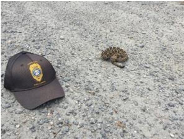
Eastern Diamondback Rattlesnake