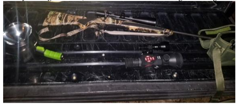
Weapon & equipment used by Bacon County deer poachers.

On December 16<sup>th</sup>, game wardens conducted night deer hunting surveillance in multiple locations across Bacon County. During the detail, 18 violations related to hunting deer at night were documented on several individuals.