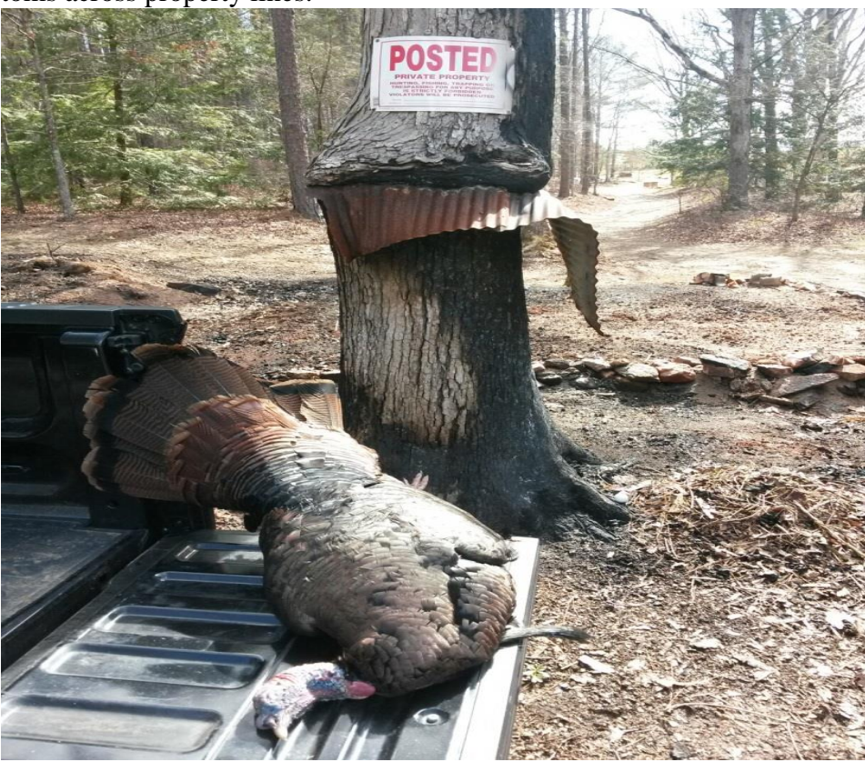
Gobbler illegally taken from private property