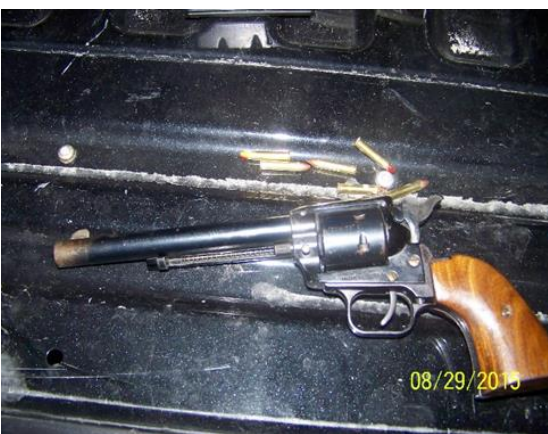
Weapons & head-mounted light used by Bacon County night deer poacher