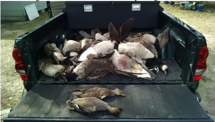
21 Canadian Geese and 2 Gadwall ducks shot over the baited area in Worth County.

On November 22 nd , Cpl. Robbie Griner located five subjects hunting geese and ducks. As he inspected licenses and the immediate hunting area, it was discovered the area was baited with corn. The five hunters were charged with hunting waterfowl over bait and twenty-one geese and two ducks were confiscated.