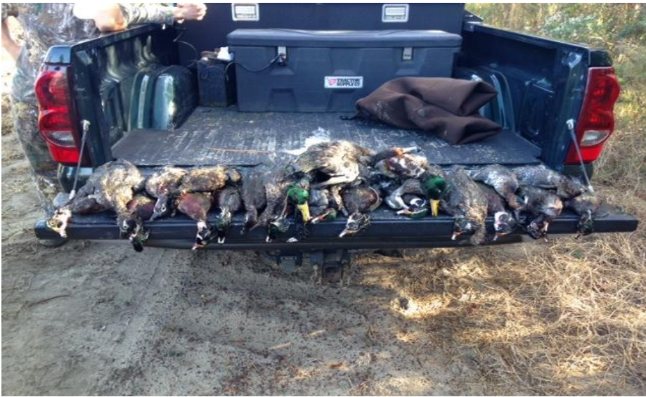
18 Wood Ducks, 2 Mallard, 3 Teal, 1 Gadwall and 1 Redhead confiscated from the Berrien County pond.