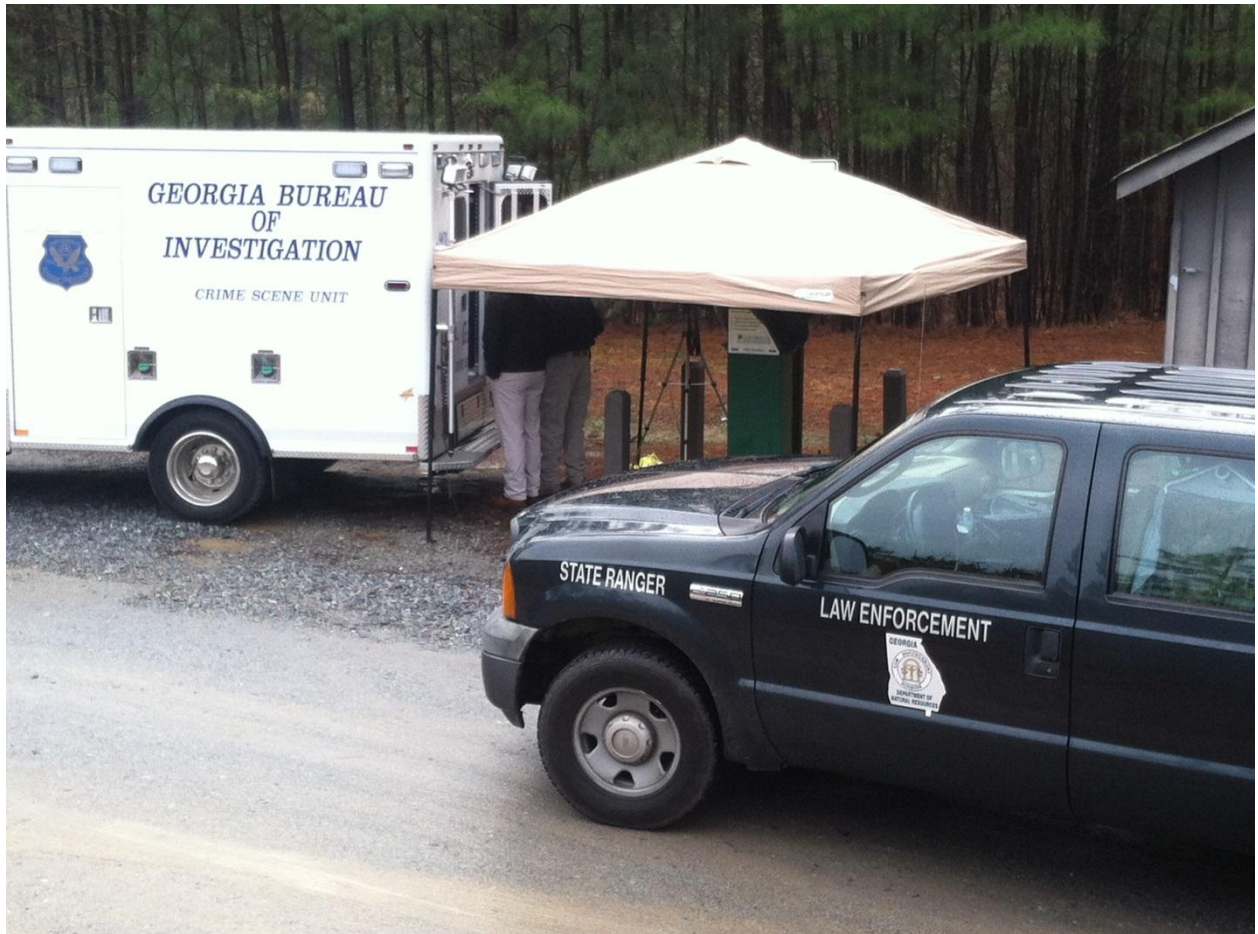
GBI Crime Scene Mobile Unit assisting DNR Law Enforcement with evidence of thefts.