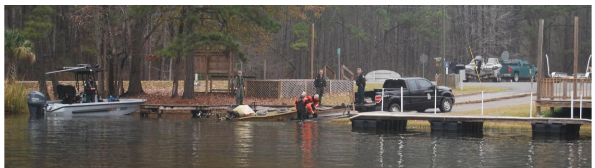
Duck Boat being recovered from scene of January 7<sup>th</sup>, fatality.

On January 10<sup>th</sup>, DNR Rangers and the GSP dive team recovered a duck boat and other evidence associated with a fatal boat incident that occurred on January 7<sup>th</sup>.