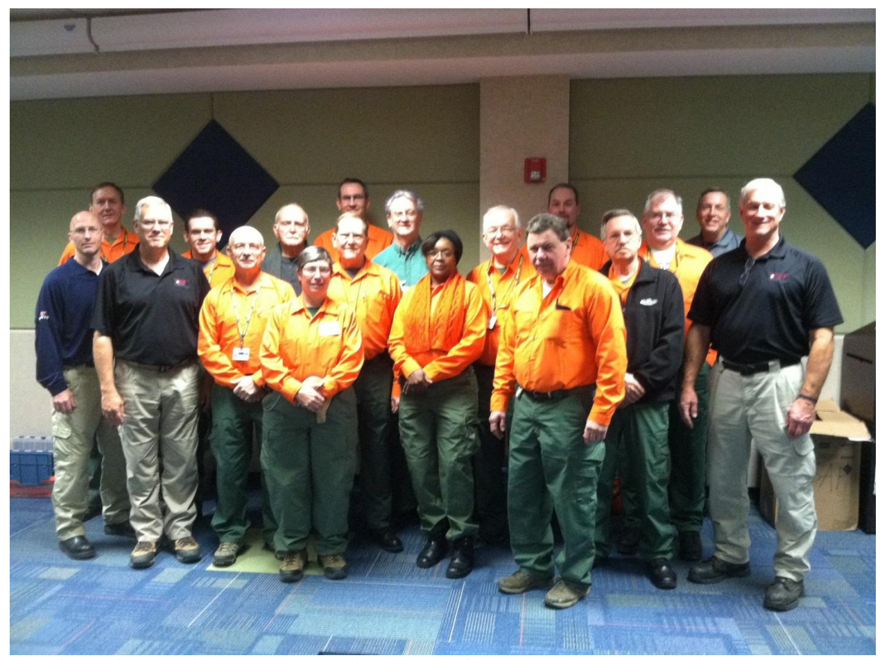
The Cobb County CERT Team and instructors from the Texas Engineering Extension Service pose after completing a three day class on "Wide Area Searches" FEMA PER 213 class.