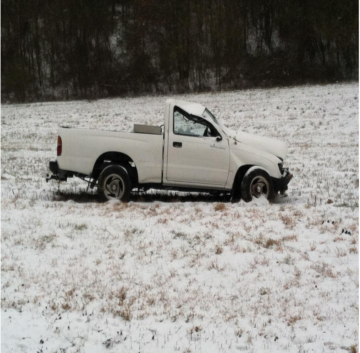
Vehicle that had lost control and hit a drainage ditch on Highway 140 causing it to roll during winter storm 2014.