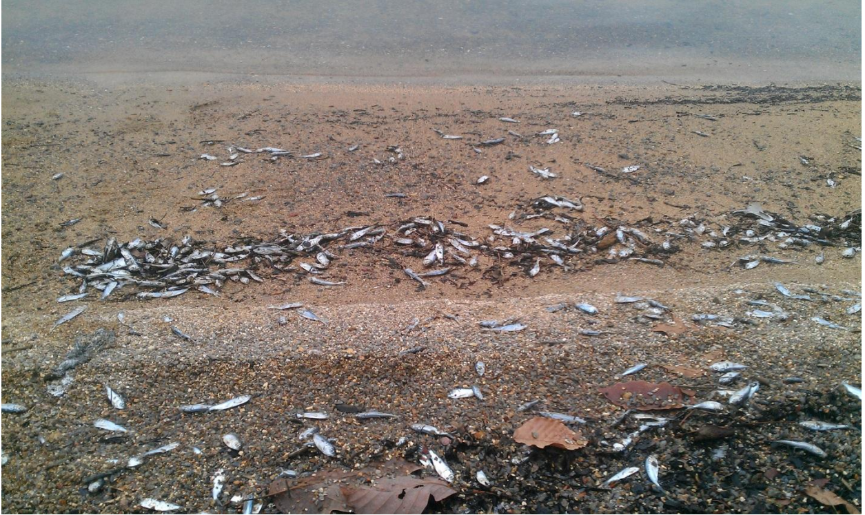
Winter Shad kill on Allatoona Lake