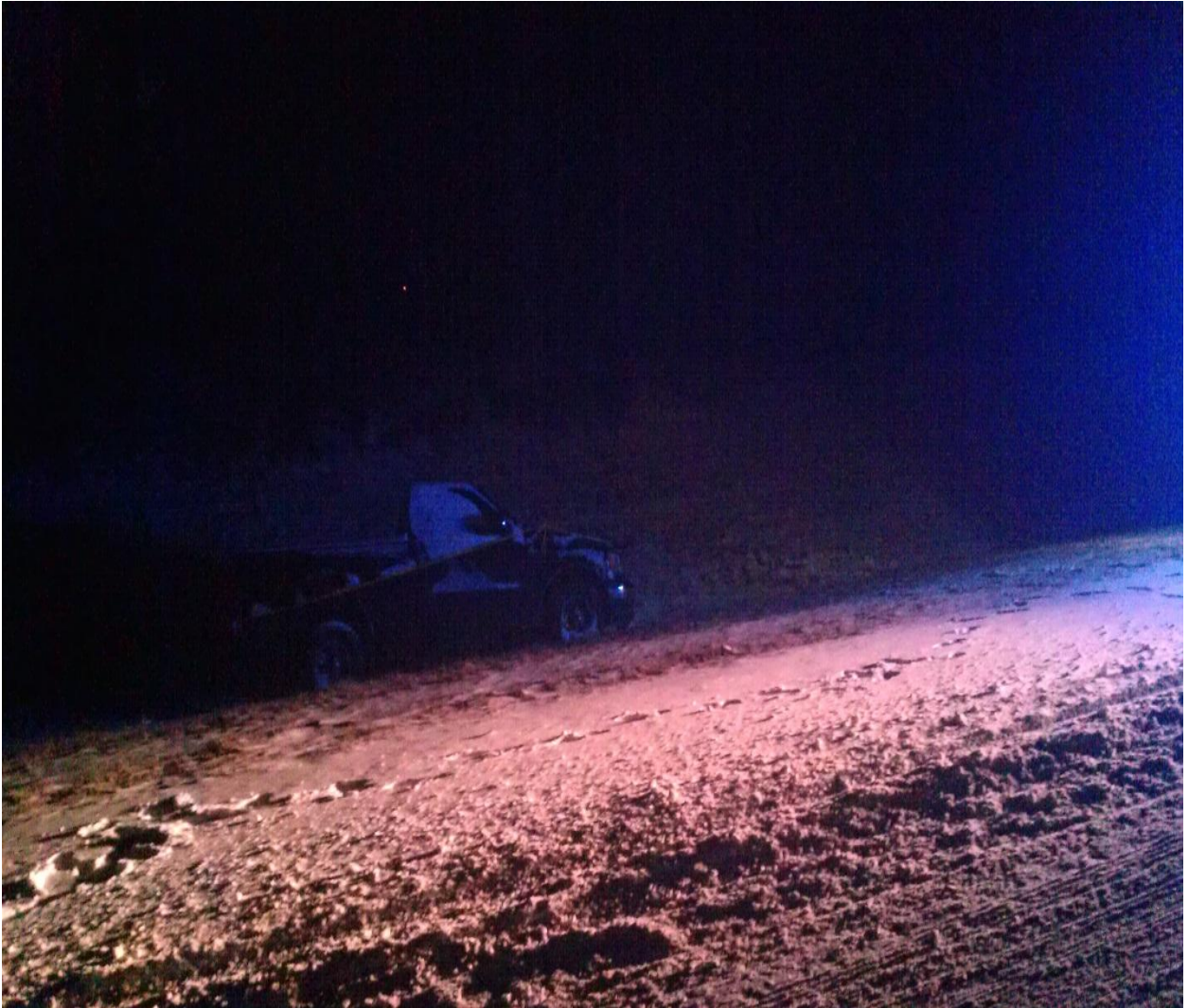
A Small truck located just after midnight by Cpl. Young on I-75 in Bartow County

On January 28th, Cpl. Byron Young patrolled I-75 in Bartow and Cobb Counties to assist motorists stranded by the winter storm. Cpl. Young located 12 vehicles off the roadway in Bartow County. Cpl. Young checked with the driver's for injuries and provided assistance. Cpl. Young found I-75 to completely be shut down at Wade Green Road in Cobb County. While on patrol Cpl. Young was asked to provide an ambulance escort through the traffic. It took over 1 hour for Cpl. Young and the ambulance to travel 2 miles on I-75. Eventually the ambulance was able to exit and get the patient to Kennestone Hospital.