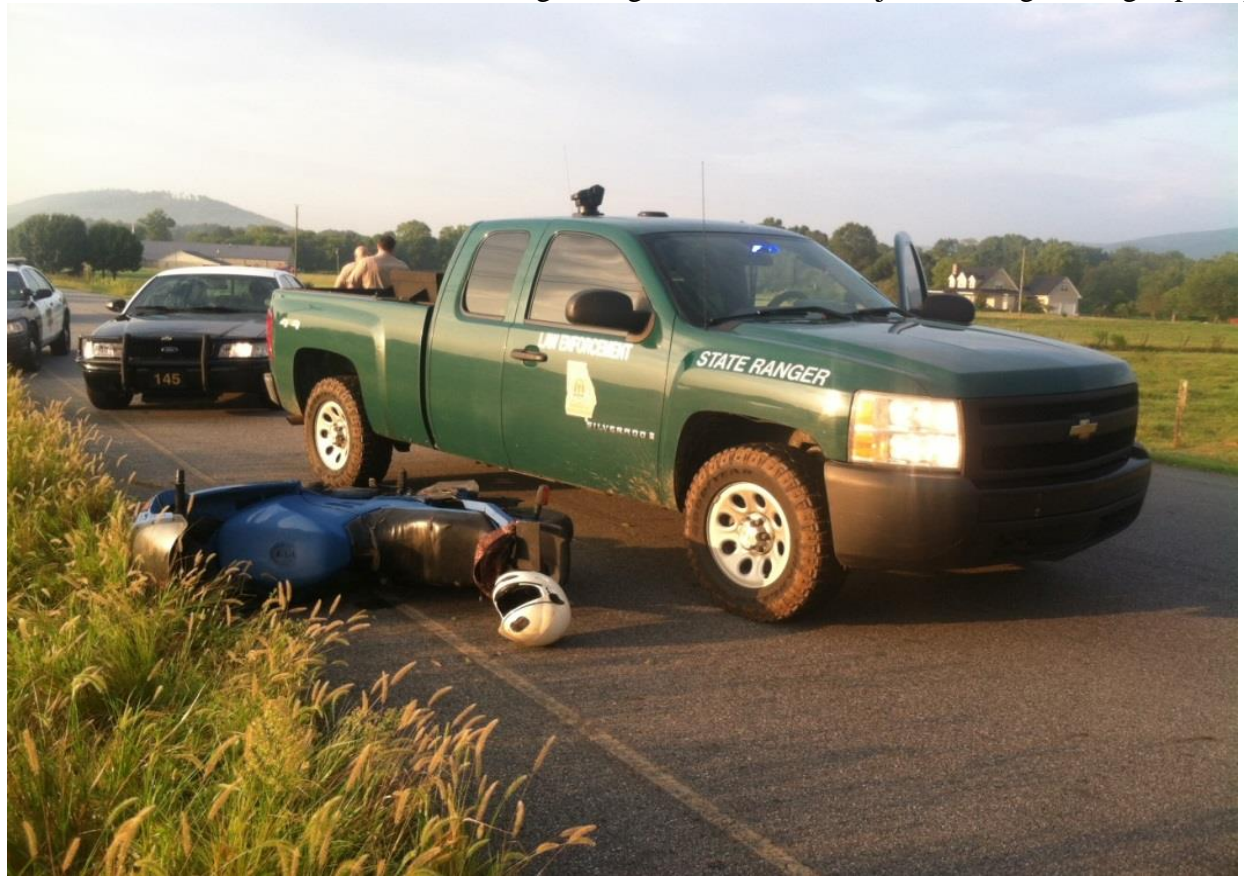
The chase ended with the motorcycle wrecking in the grass along Sugar Valley Rd.

On September 5<sup>th</sup>, Cpl. Shawn Elmore assisted the Georgia State Patrol in a pursuit with a motorcycle. The motorcycle had fled from GSP and travelled at extremely high rates of speed through the city of Calhoun and through several schools zones during the morning drop off times for the schools. The motorcycle wrecked on Sugar Valley Rd after making an attempt to turn into a cemetery. The suspect was arrested and charged with numerous traffic violations as well as drugs charges. No one was injured during this high speed pursuit.