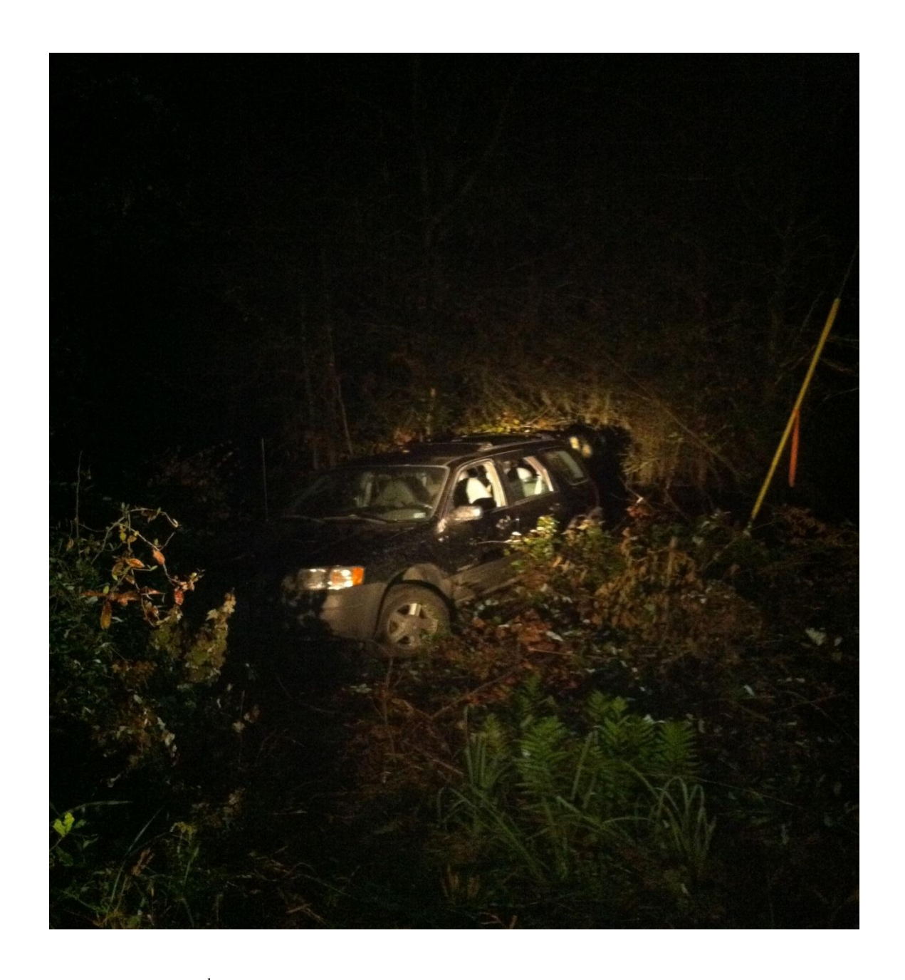
On November 2<sup>nd</sup>, 2013, at approximately 11:30P.M., Cpl. Chase Altman, flying as an observer, in a DNR airplane spotted a vehicle with a spotlight being shined out of the vehicle as it went by several fields. Cpl. Tommy Daughtrey and Ranger Daniel North were guided to the suspect vehicle by air from Cpl. Chase Altman. A stop was made on the vehicle. Three subjects were arrested for: hunting deer at night, hunting big game from a public road and hunting from a vehicle.