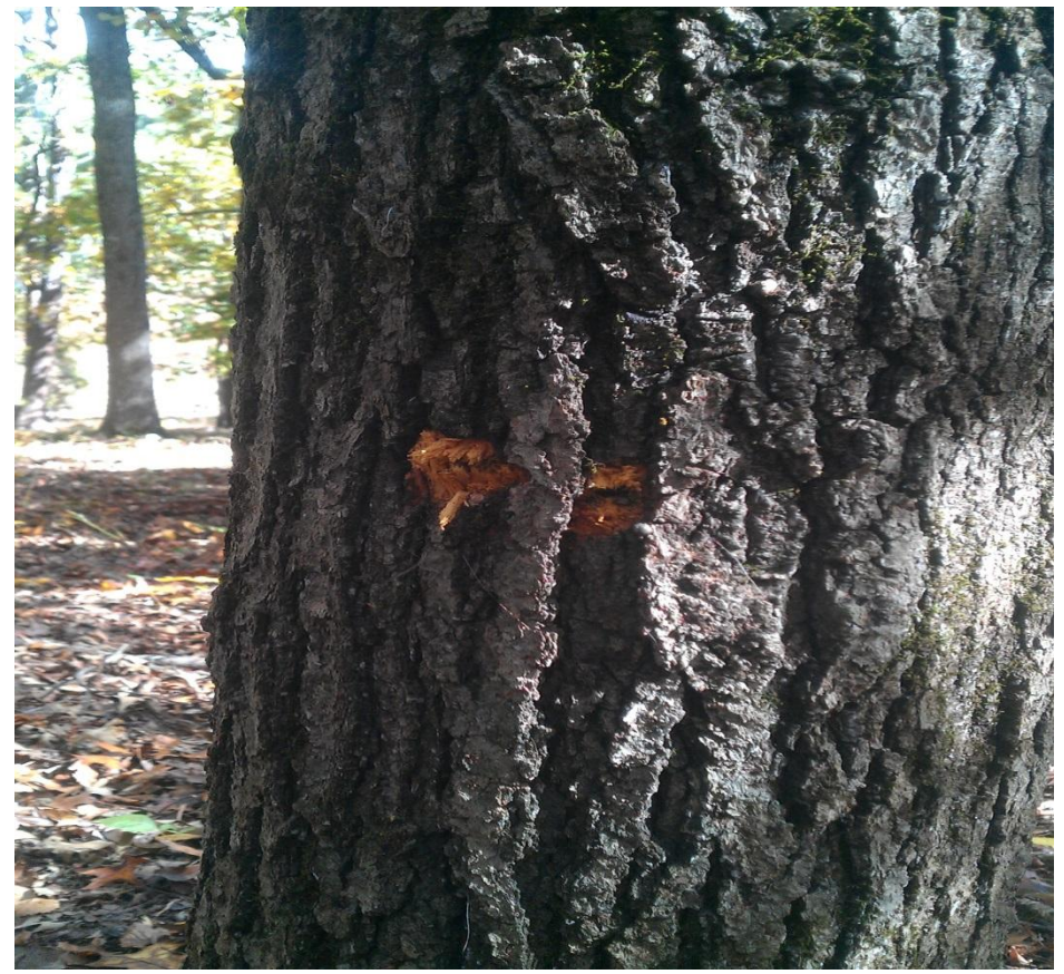
Bullet strike on tree 84 feet from a public road