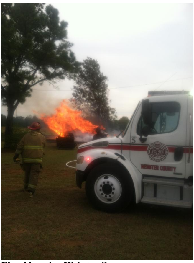
Illegal burning Webster County

On October 31<sup>st</sup>, Sgt. Butch Potter responded to an illegal burning call. The individual responsible for the fire was charged with illegal burning of egregious litter.