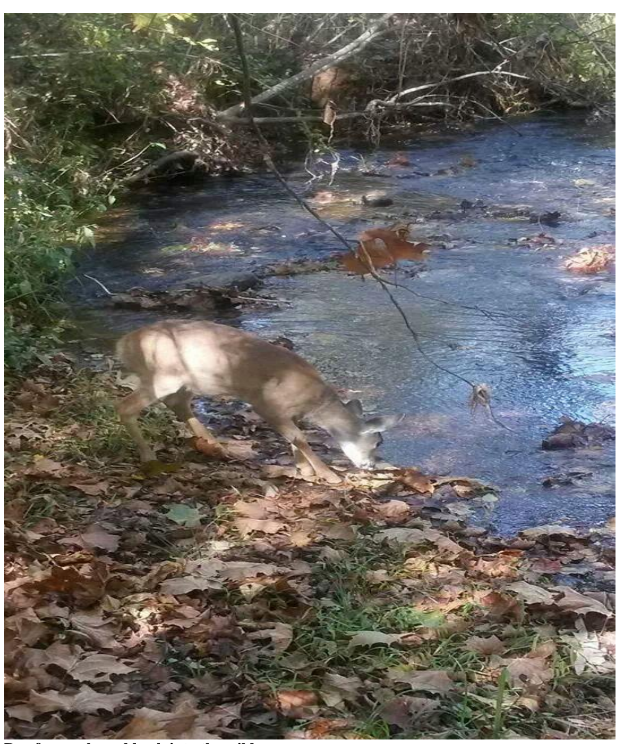
Doe fawn released back into the wild.