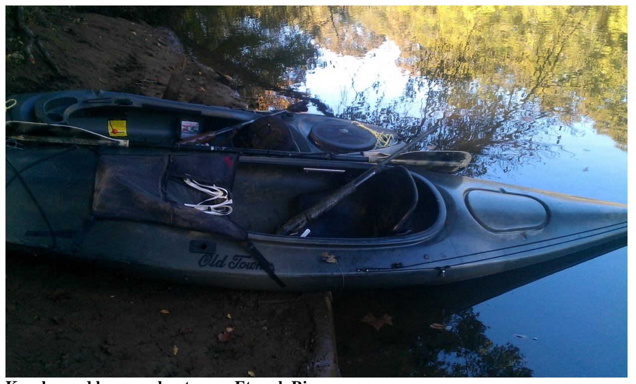
Kayaks used by goose hunters on Etowah River.

On October 20th, Cpl. Byron Young and RFC Brooks Varnell were patrolling the area of Hardin Bridge Road and the Etowah River. The Rangers located two young hunters who were goose hunting out of kayaks on the Etowah River. The two young hunters were found to be hunting without a federal duck stamp and unplugged shotguns. The young hunters were issued warnings for the violations. The Etowah River is a cold water environment and any winter boaters should be prepared, use life jackets, let family or friends know the float plan, and have a plan to deal with an overturned boat or bad weather.