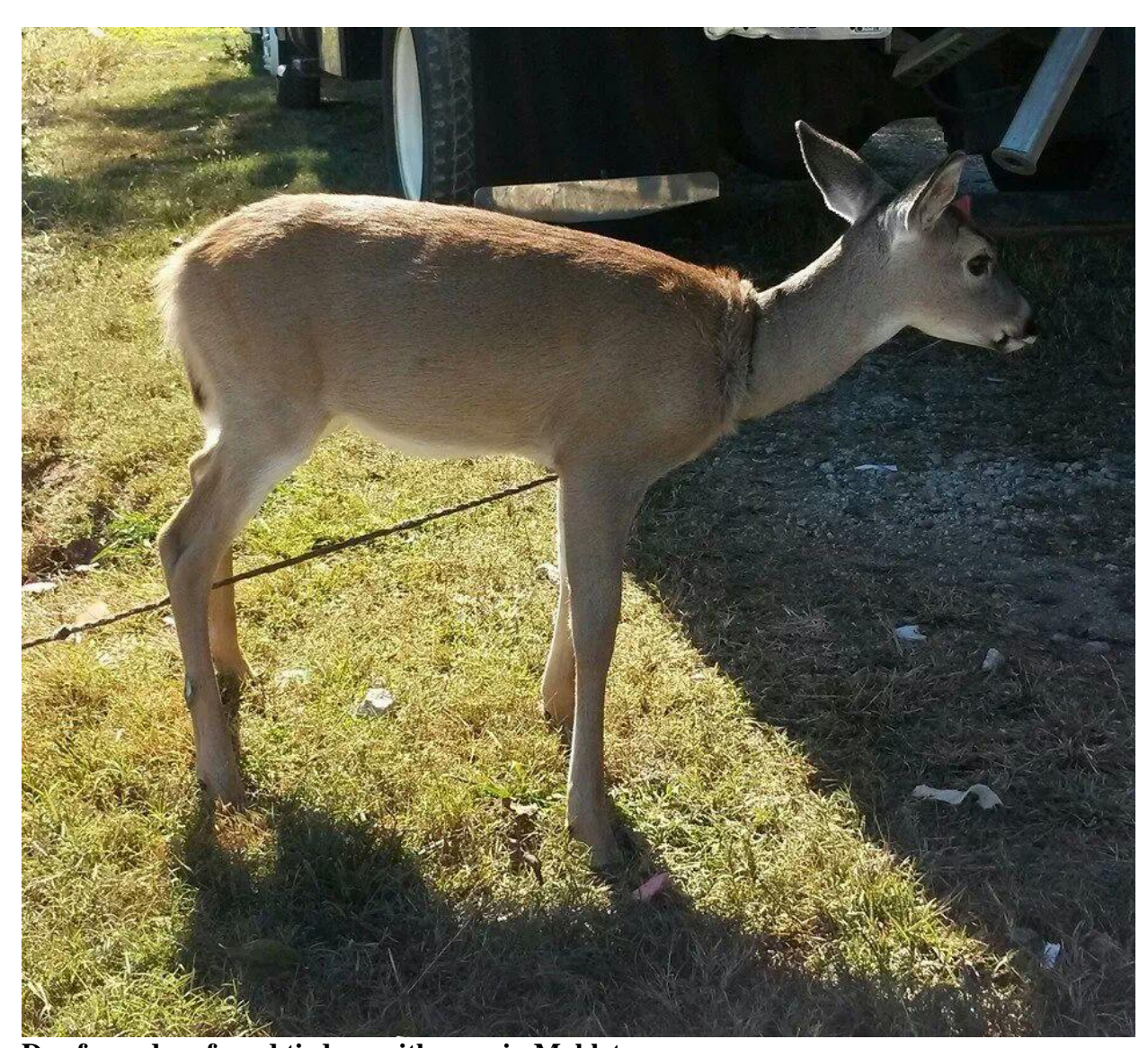
Doe fawn deer found tied up with rope in Mableton.