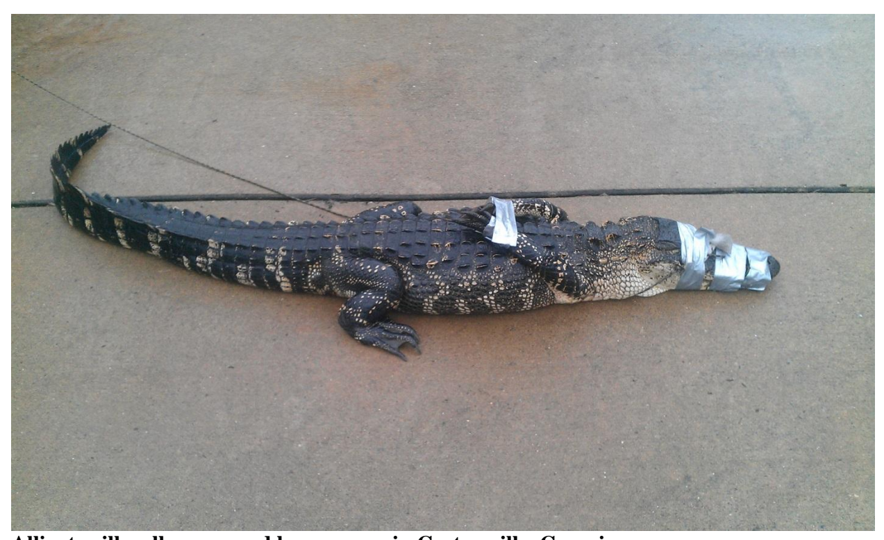
Alligator illegally possessed by a person in Cartersville, Georgia.