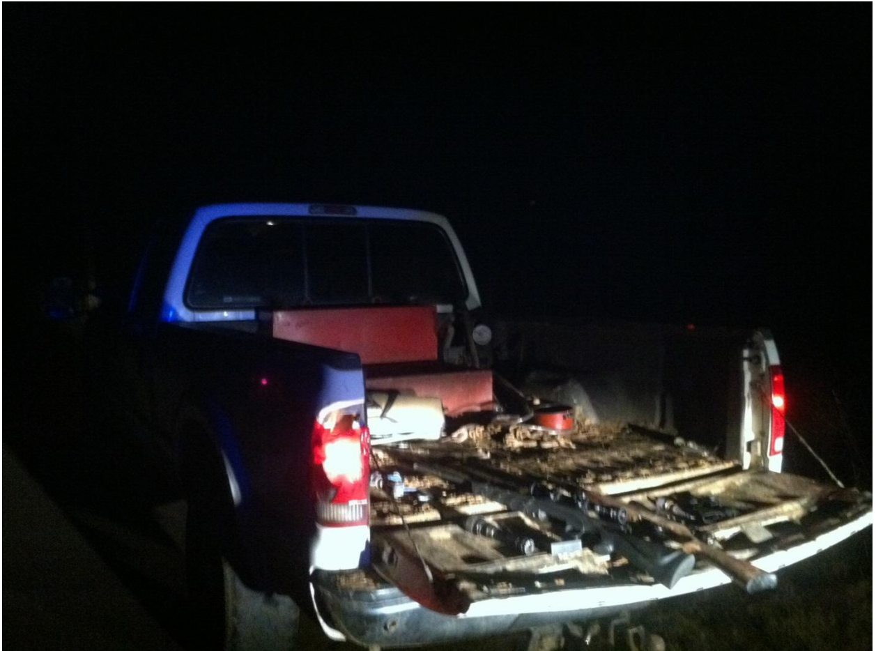
A loaded 30-06 rifle, .22 caliber rifle, .380 pistol, and two flashlights were documented during a night hunting stop in Adairsville in an area known for deer.