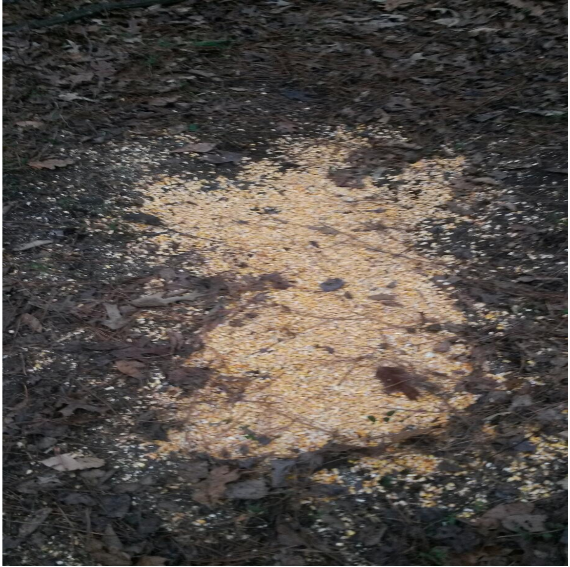
Whole corn located 15 yards from stand

On December 19th, Cpl. Lee Burns investigated a report of a doe deer shot off Iron Mountain Road found on property no one had permission to hunt. Cpl. Burns checked and located a large area baited with whole kernel corn and mineral blocks. Cpl. Burns was foot patrolling the area the following day and saw a person walking towards the baited area from an adjacent subdivision. The hunter went past Cpl. Burns and to a tree stand overlooking the bait. The hunter was located about 15 yards from the corn and mineral blocks. The hunter was also not wearing fluorescent orange as required during firearms deer season. The hunter was issued citations for hunting big game over bait, hunting deer without orange, and hunting without a big game license. The hunter stated he had no knowledge of the deer shot over the bait the previous day.