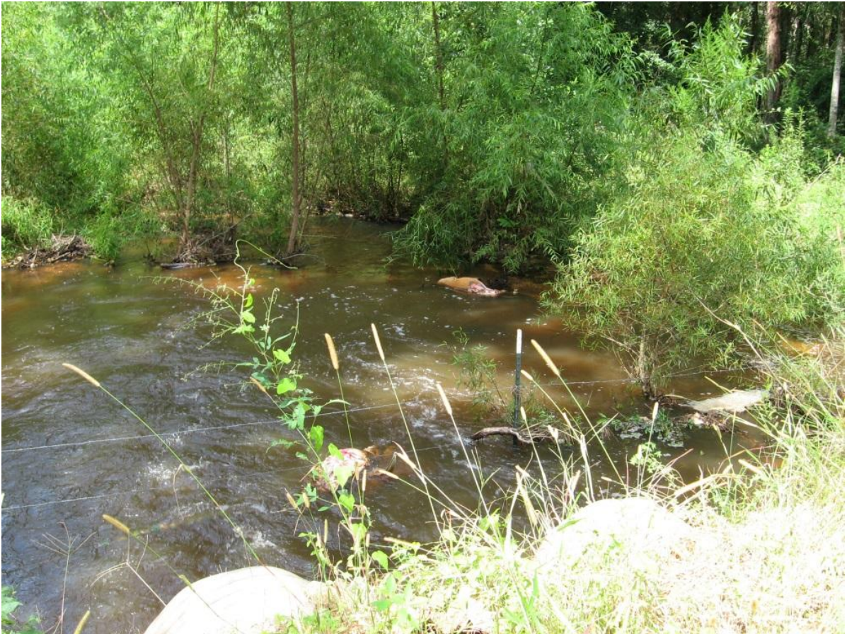
Two deer carcasses illegally dumped in Daniel's Creek, Worth County