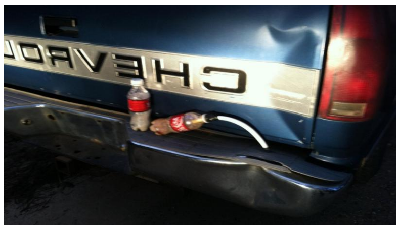
(Mobile "meth lab" seized from vehicle in Thomas County)