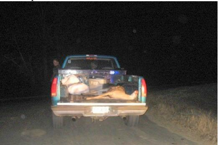
(Thomas County night deer hunters and illegally taken deer)

At midnight, a vehicle approached the field and dropped out three suspects before driving away. As the rangers watched from nearby, the suspects walked directly to the deer without using any lights, grabbed it, and quickly headed back to the road. The truck returned a short time later and once the deer was loaded, the rangers stopped the truck and its occupants. Three adults involved in the incident were charged for hunting deer at night, hunting out of season, hunting without permission, and possession of illegally taken wildlife. Two juveniles were party to the crime, one even serving as the driver when the suspects were dropped off, but neither was charged. The deer was donated to the complainant.