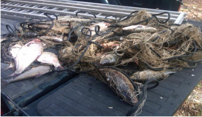
Illegal gill nets on Lake Seminole