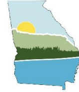
Environmental Protection Division