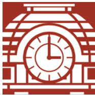
Historic Preservation Division